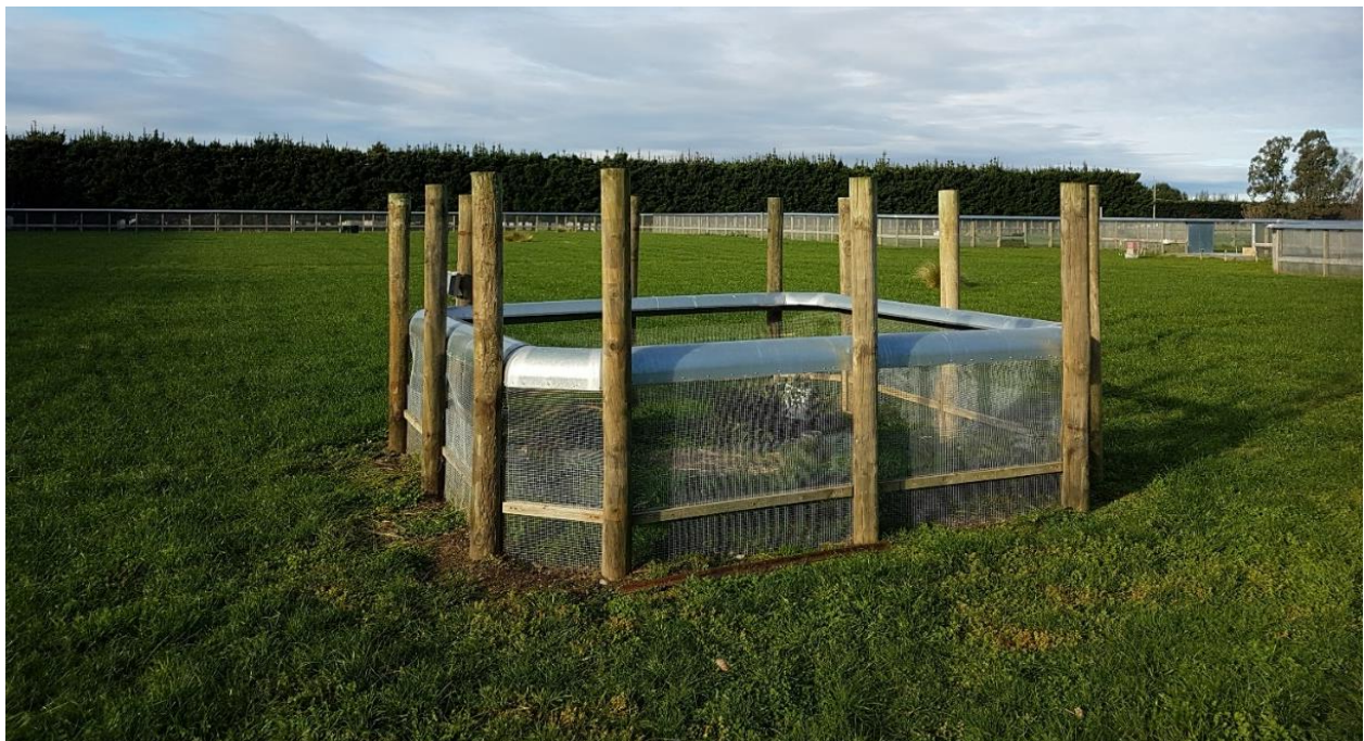
Figure 1. 4 m x 4 m internal pen inside the 2 hectare predator enclosure.

The ZIP predator behaviour facility at Lincoln includes a 2 hectare predator enclosure constructed using an industry standard 1,800 mm high predator fence (Day T. and MacGibbon R. 2007). To test the 'escape' abilities of possums, rats and stoats, we constructed a 4 m x 4 m 'internal pen' within the confines of the larger enclosure. The internal pen is constructed of the same materials as the surrounding enclosure, except that it features a removable cap and mesh system that can be lowered or raised depending on the animal being tested.