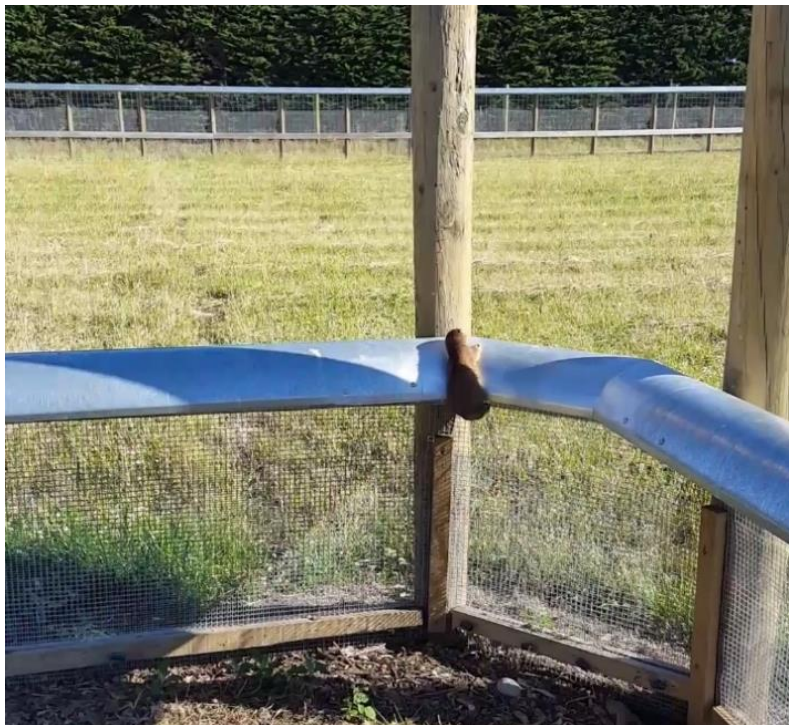
Figure 4. Stoat successfully escapes from 900 mm fence by jumping from the wooden batten below (which had the effect of reducing the cap overhang distance).

The successful escape at the 900mm height is considered to have been achieved when the stoat jumped on to the capping from the top of a wooden batten set against the mesh inside the pen (Figure 5 below). Due to the width of this batten, it effectively reduced the cap 'overhang' width from 250 mm to around 220 mm which proved to be within the stoat's physical capability to overcome the effect on its centre of gravity of reaching up to the top of the cap.